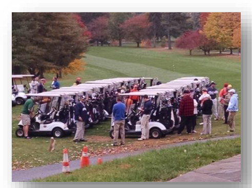
Eighty golfers challenged Reading Country Club on October 25 in the annual Jack O'Lantern Classic.