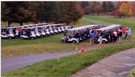
Eighty golfers await the start of the 2015 Jack 'O' Lantern Classic at RCC on October 25.