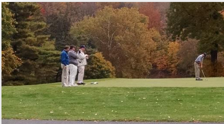
Play is intense on the 16 th green.