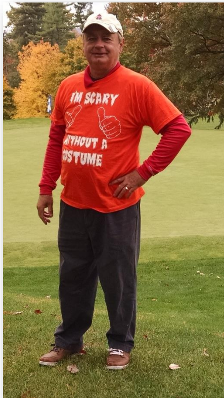
Some golfers play the Jack 'O' Lantern Classic in costume. Well, sort of.